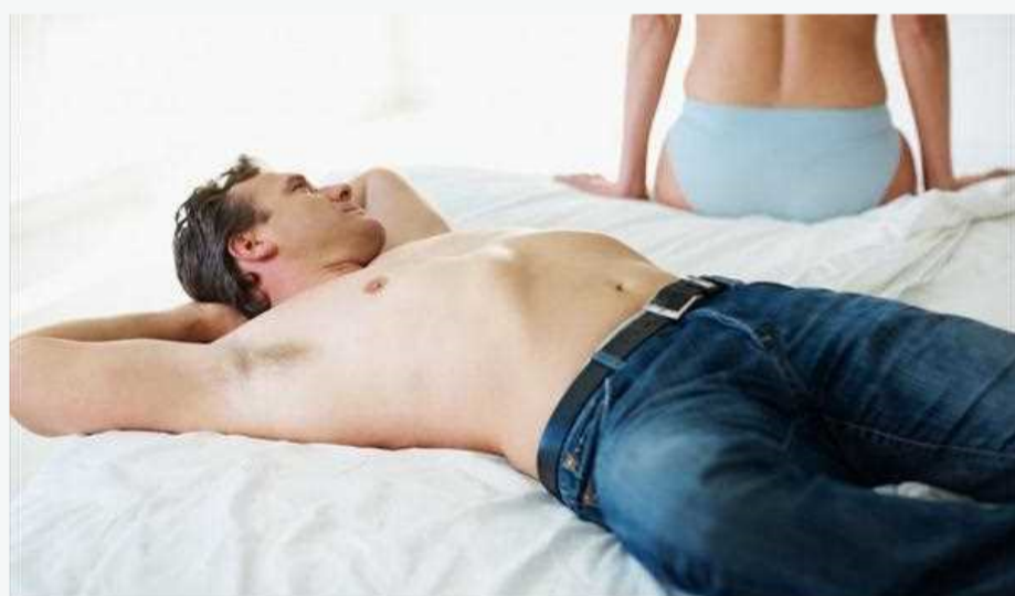
Pheromones Pheromones Attract